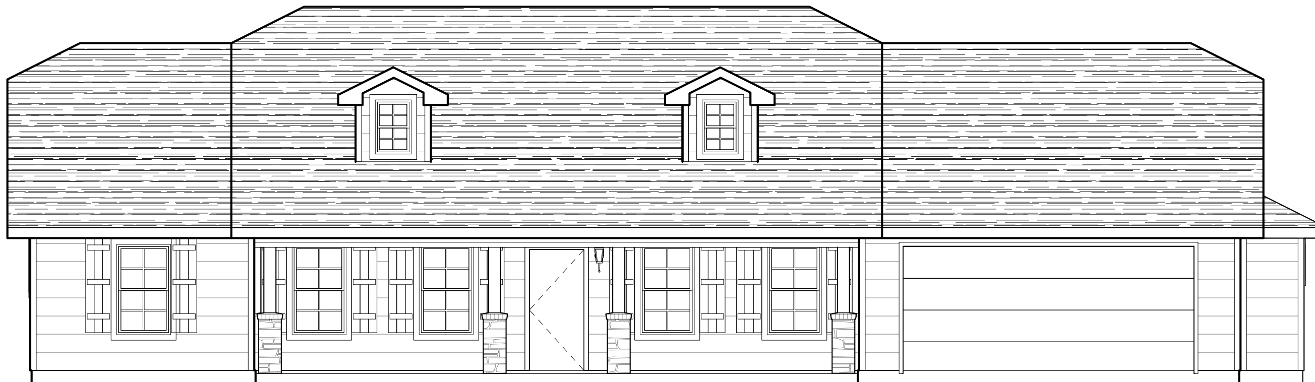
2 D Elevation 3/16" = 1'-0"